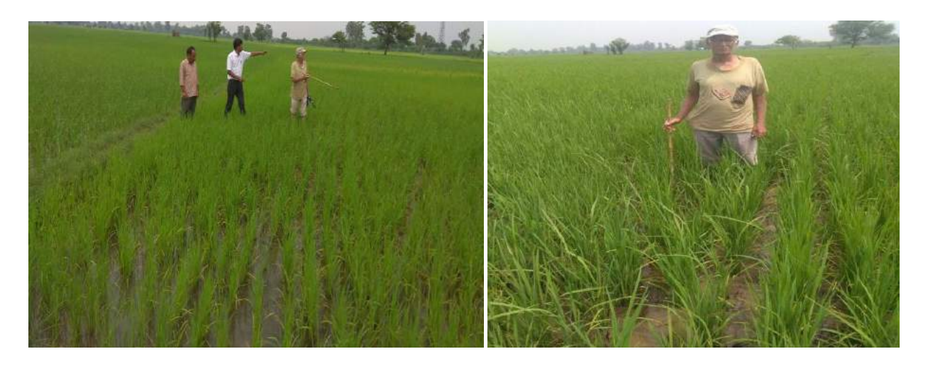
Direct Seeded rice sown with drum seeder in farmer's field at R.S. Pura