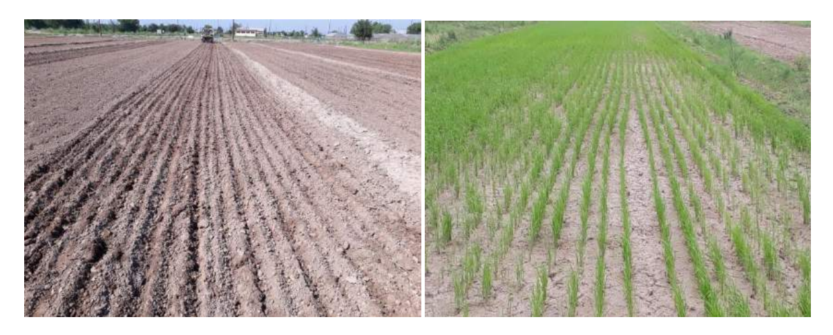
Rice crop sown with Zero Seed Drill

Zero Seed Drill and Seed cum Fertilizer Drill recommended for sowing of wheat can also be used for direct seeding of rice after proper calibration under the guidance of technical persons and with certain modified procedures of sowing.